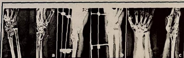
Figure 3: X rays a) Pre-operative b) post-operative c) 6 months after operation