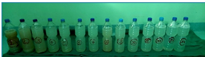
Fig 1: Milky effluent fluid becoming more clear in subsequent lavages shown in numbered bottles

normal saline was infused in first cycle followed by five minutes of chest physiotherapy (percussion) and the saline was drained out. The position was maintained as head up and left lateral tilt during saline instillation to prevent spillage in right lung and trendelenburg, left lateral tilt during drainage out. Ten cycles of the lung wash was performed with around six litres of normal saline till milky effluent drained fluid was more clear. It took two hours and 40 minutes with positive balance of 340ml and urine output of 500ml. During the procedure, there were episodes of desaturation down to 70% which was managed with both lung ventilation, PEEP, 100% oxygen and manual bagging and saturation maintained at 85-90%. Lung compliance, peak airway and plateau pressures were also monitored. At the end of the procedure, DLT was exchanged with the single lumen tube with subglottic suction size 7 mmID and lung recruitment was done. Inj Furosemide 20mg was given. Patient was kept in mechanical ventilation in airway pressure release ventilation mode with muscle relaxant and fentanyl sedation. Postoperative ABG and chest X-ray were sent. She was extubated next day and could maintain oxygen saturation of 90-92% with FiO 2 of 0.9 which could be tapered to 0.6 after two days.